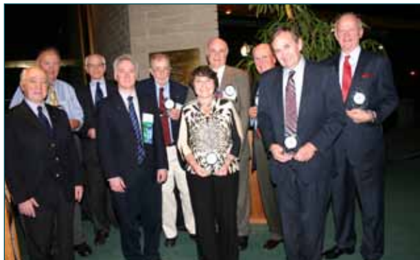
Past Chairs Assembled for CCR's 30 th Anniversary

Annual Meeting support was provided by Argonne Laboratories, NIST, NSF and the University of Utah.